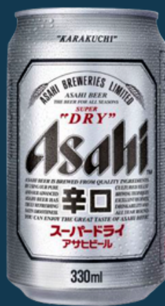
ASAHI 120 THB