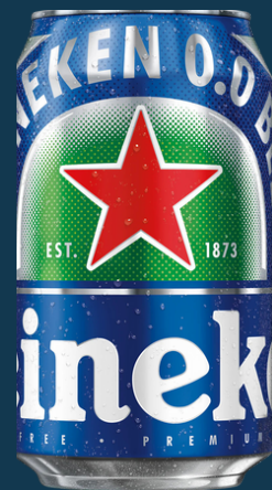
HEINEKEN ZERO 80 THB