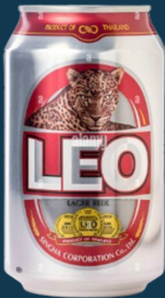
LEO 80 THB