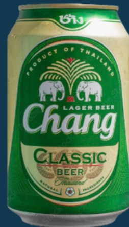
CHANG 80 THB