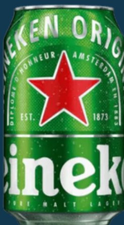
HEINEKEN 120 THB