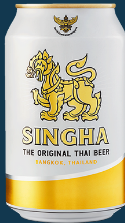
SINGHA 80 THB